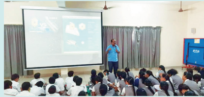
James Webb Space Telescope